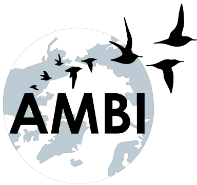
Arctic Migratory Birds Initiative

Arctic Migratory Birds Initiative (AMBI): protecting Arctic lifestyles and peoples through migratory bird conservation is a project designed to improve the status and secure the long-term sustainability of rapidly declining Arctic breeding migratory bird populations. AMBI has developed the Arctic Migratory Birds Initiative Work Plan 2015-2019 to identify priorities and guide actions.