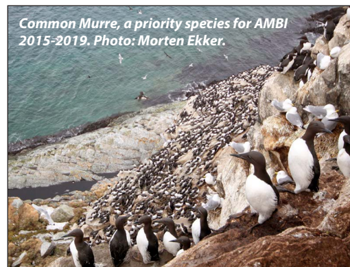
Common Murre, a priority species for AMBI 2015-2019.

Traditional knowledge is a fundamental element in successful wildlife co-management programs. Arctic countries will engage with indigenous knowledge holders to incorporate indigenous perspectives in conservation and research and include community-based monitoring as a tool to reach conservation goals.