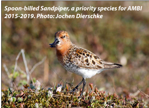
Spoon-billed Sandpiper, a priority species for AMBI 2015-2019.

Important breeding and staging sites for Spoon-billed Sandpiper , Bar-tailed Godwit and Dunlin need to be identified and protected in Arctic Alaska and Russia .