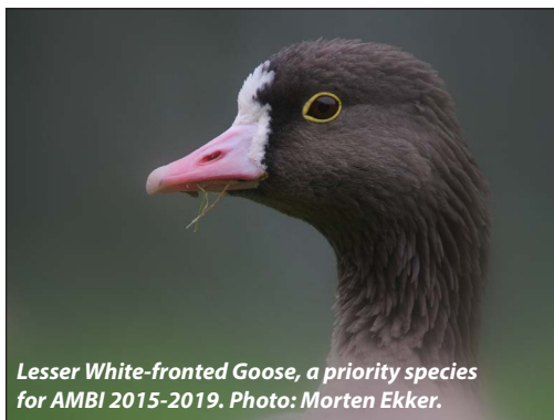
Lesser White-fronted Goose, a priority species for AMBI 2015-2019.

The Bijagós Archipelago of Guinea-Bissau is affected by unsustainable land use , such as illegal fishing, mangrove cutting, floodplain conversion to agriculture and coastal erosion. This affects the Red Knot and Bar-tailed Godwit .