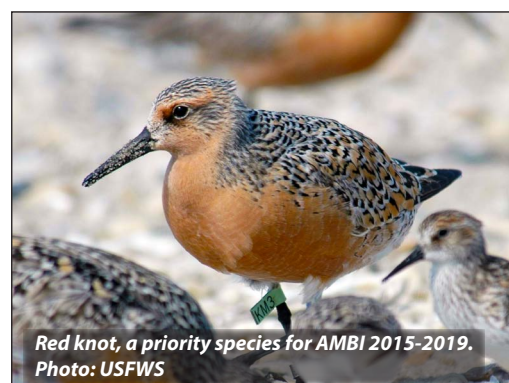
Red knot, a priority species for AMBI 2015-2019.

The northern coast of South America , and in particular the coastline from eastern Guyana through Suriname and French Guiana to northern Brazil is affected by coastal development and habitat destruction . Priority species are the Semipalmated Sandpiper and Red Knot .