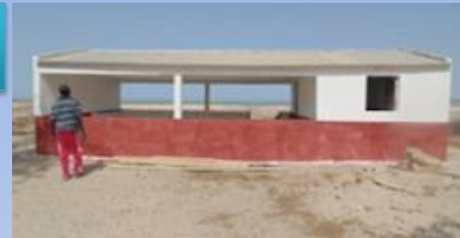
Environmental centre, Jeta, Guinea Bissau